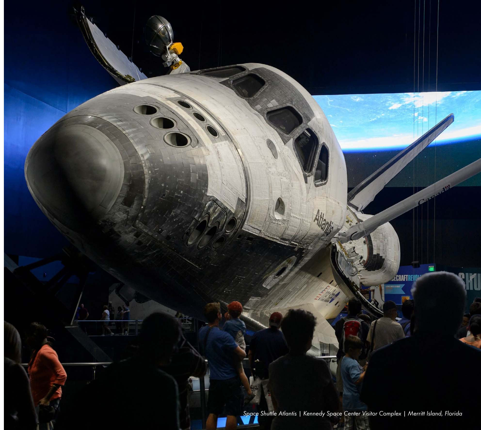
Space Shuttle Atlantis | Kennedy Space Center Visitor Complex | Merritt Island, Florida