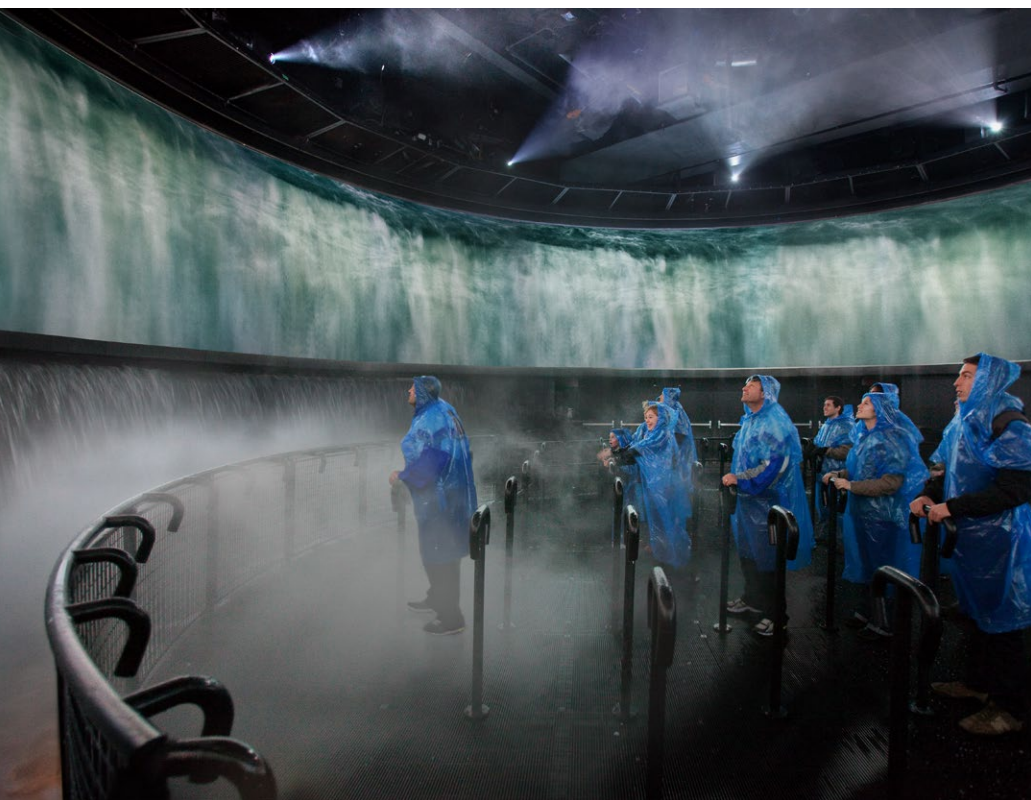
TABLE ROCK WELCOME CENTRE